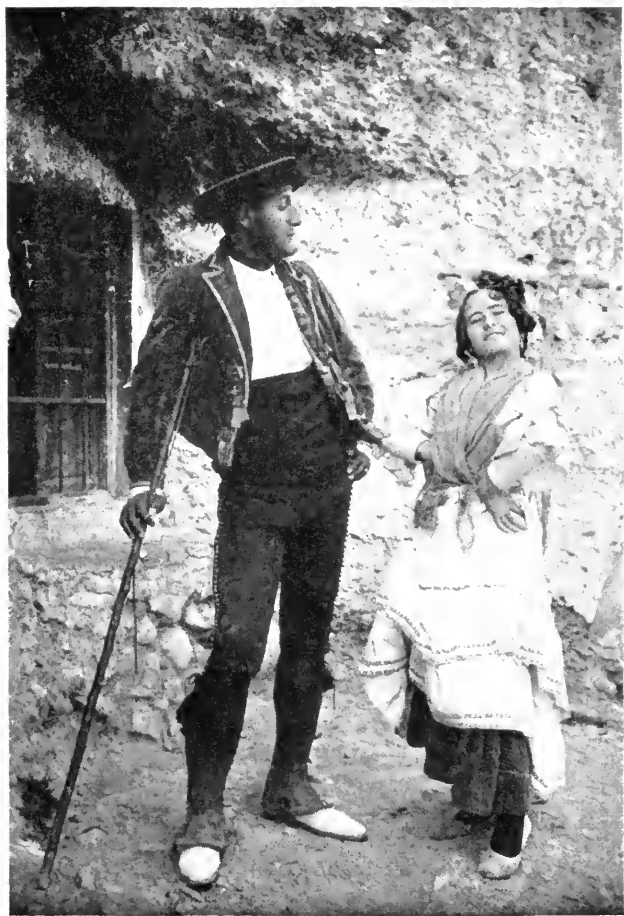
“A little saint with a color more lightful than orange.”